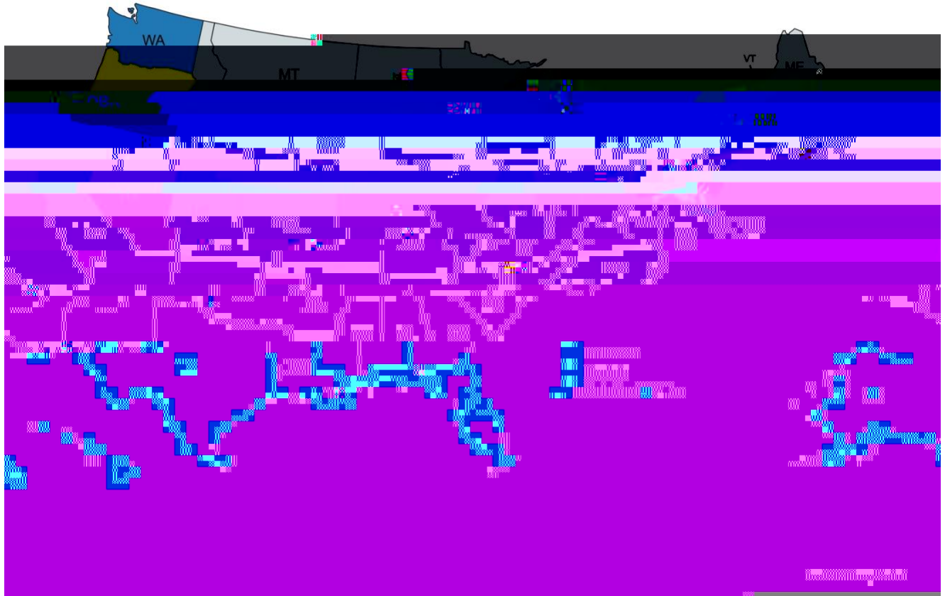
Figure 3 Locations in the United States, 2021

Experiences ranged from policy or data analysis to business sustainability based work in various locations and with employers across the globe. United States locations included Alabama, California, Colorado, the District of Columbia, Florida, Hawaii, Illinois, Maryland, Massachusetts, Mississippi, Nevada, New Jersey, New York, North Carolina, Oregon, Pennsylvania, Texas, Utah, and Washington. The work style color scheme in Figure 3 indicates whether the student was in a state conducting in-person work (yellow), remote work (blue), or a hybrid work arrangement (green).